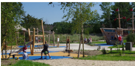
Childrens Games Parc de la Chaumière - free