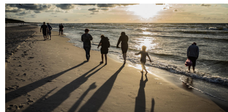
Walks ont the beach