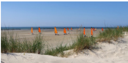
The Sand Yatch- +33 (0)3 21 89 60 81