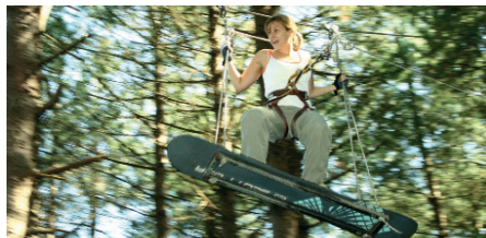
Opalaventure - Open 7j/7 +33 (0)6 81 64 23 42