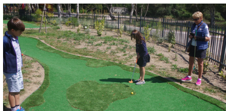
Mini-Golf - Parc de la Chaumière +33 (0)7 81 98 46 33